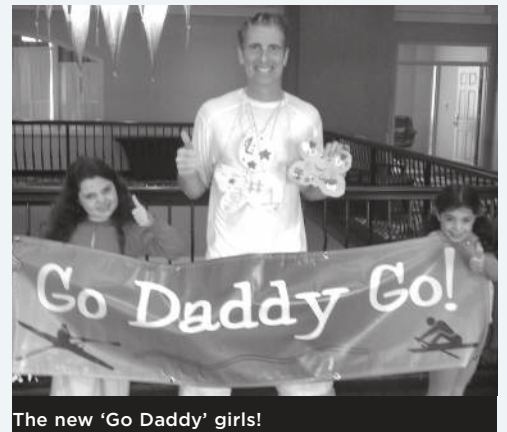
The new 'Go Daddy' girls!