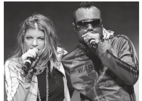
Apl doesn't have to worry about Fergie knocking out his contact lens on stage anymore.

APL.DE.AP OF THE GRAMMY WINNING MEGA GROUP BLACK EYED PEAS was suffering from high nearsightedness. It was so high that his contact lenses couldn't fully correct his vision. His lenses have on occasion fallen out during concerts, and Fergie even accidentally knocked one contact lens out during a performance! Add to that a condition called nystagmus that he has had since his birth in the Phillipines which causes the eyes to rapidly "jiggle" back and forth. Apl had seen many eye doctors over the years, but none could offer any help. When he came to me, I suggested a means to solve a couple of problems with a single procedure called the Visian ICL. The Visian ICL is a tiny lens implant that is inserted behind the iris of the eye in a 10 minute, typically painless, procedure with usual vision recovery within 24 hours. Apl's procedure caught the attention of the #1 network morning show, Good Morning America , who captured the procedure and aired it to millions of viewers. Apl is now seeing better than ever and best of all he doesn't have to worry about losing a contact lens on stage in front of thousands of fans. To watch the incredibly insightful segment, please go to www.ICLInfo.com .